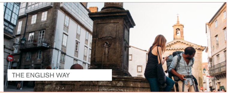
THE ENGLISH WAY