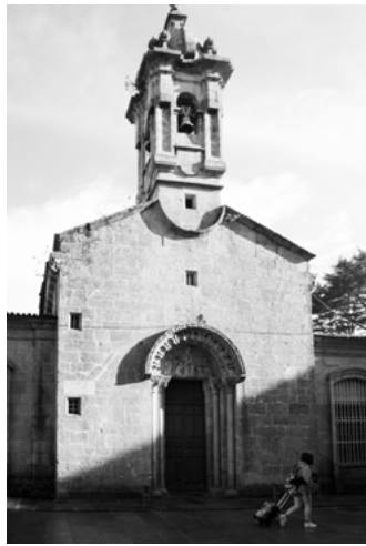
D Iglesia de San Fiz de Solovio