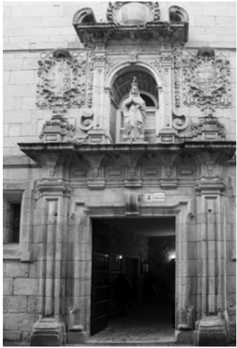
A Convento das Orfas