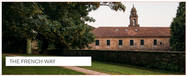
THE FRENCH WAY