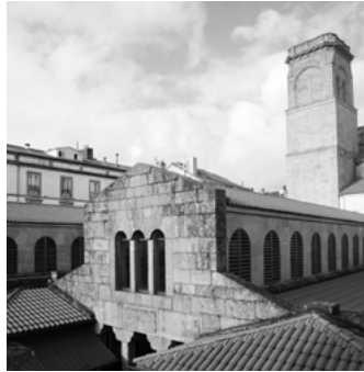
C Mercado de Abastos