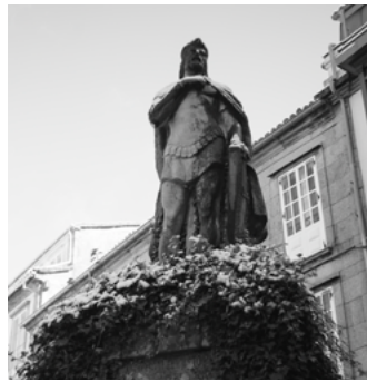
E Alfonso II el Casto sculpture