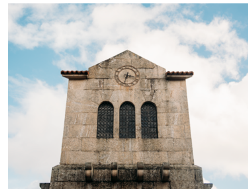
FACING Small stall outside the market ABOVE Restaurants around the market BELOW Market clock tower

The bustle of people coming and going, laden with bags, signals our arrival at the square or Mercado de Abastos 7. It is a place that has undergone a profound transformation in the last decade, not so much in its architectural historicism - which remains unchanged - but in the activities and culinary offerings that