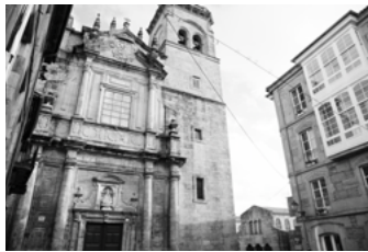
B Iglesia de San Agostiño