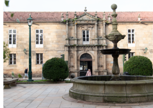
FACING Playing with Two Mariás BELOW Rosalía de Castro School

In the nearby Praza de Rodrigo de Padrón 7 several terraces open up, like flowers to the sun. This is an ideal place to take a break with a well-deserved snack before taking a look at no. 5 in the square, Mimolett , a boutique store with Parisian airs and international brands and, especially, clothes for very special occasions.