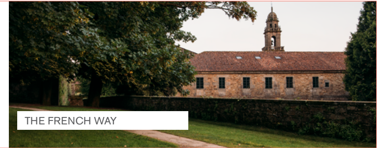
THE FRENCH WAY