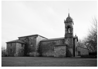
E Iglesia de Santa Susana