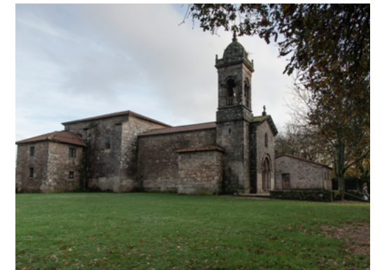
FACING, ABOVE Modernist building in Rúa do Pombal FACING, BELOW Santa Susana oak grove ABOVE Pavilion of the Regional Exhibition of 1909 BELOW Iglesia de Santa Susana

Along this road we reach one of the entrances to the Alameda de Santiago 6, a 19th century park that is the true green lungs of the city and is part of the Ruta de la Camelia (Route of the Camellia) and the Jardines de Invierno (Winter Gardens). It is a pleasure to be able to take in the spectacular rhododendrons or the imposing eucalyptus trees in the flowering season of the camellias or the