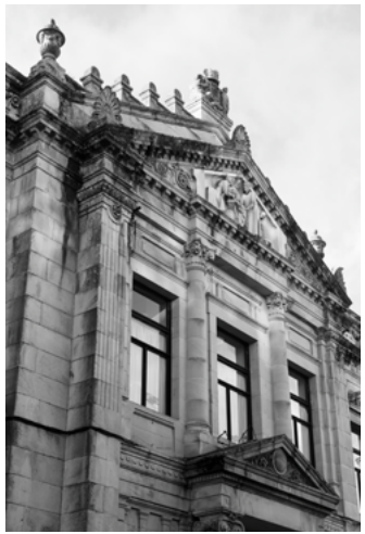
A Faculty of Medicine