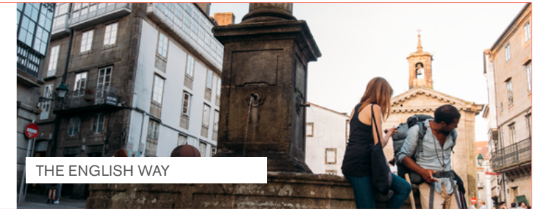
THE ENGLISH WAY