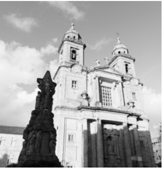
B Iglesia and Convento de San Francisco