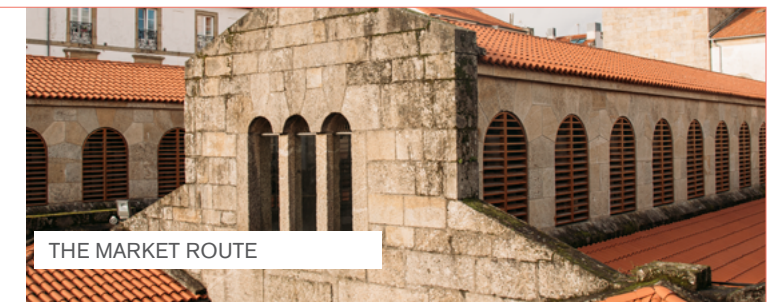
THE MARKET ROUTE