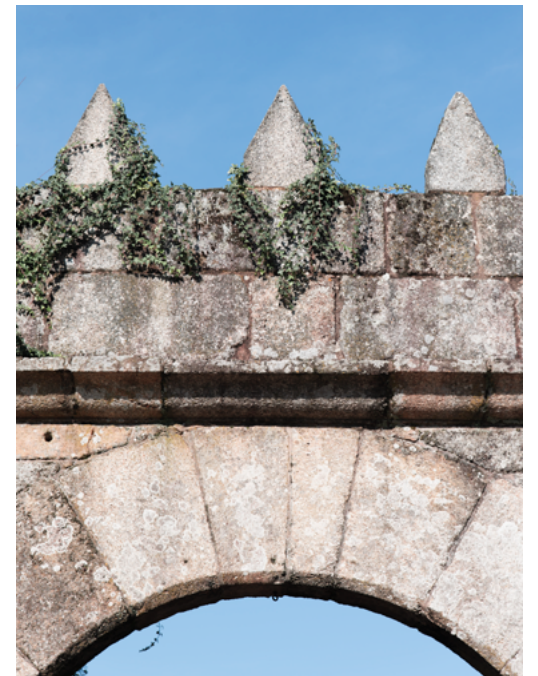
ABOVE Iglesia de Santo Domingo BELOW Detail of the Porta Nova

Café-Bar Calvo is close at hand, which on Sundays, holidays, and the 10th and 25th of every month, at the same time as the fortnightly fair, serves pulpeira octopus street food in addition to its normal menu. The bar, especially its lovely terrace, is a wonderful spot to enjoy a good Ribeiro wine with á feira (fair-style) octopus.