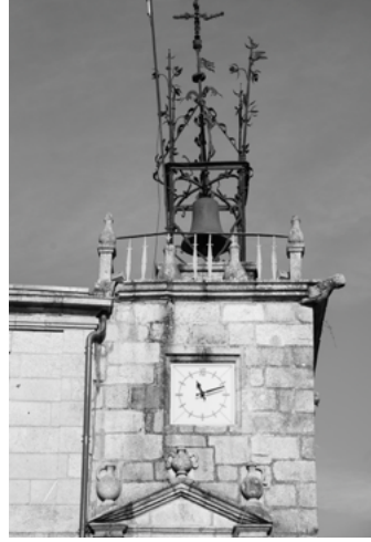
B Praza Maior