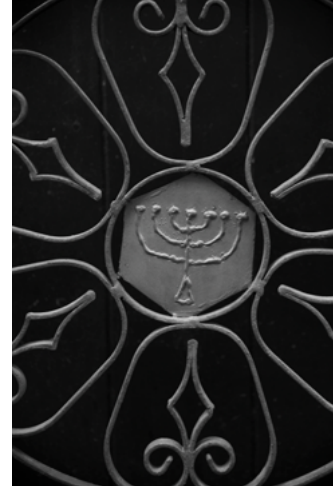
E Barrio Judío