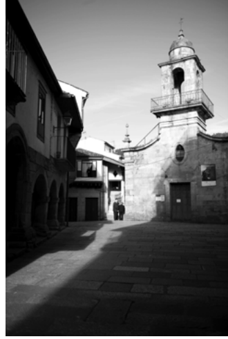
D Igrexa de Maria Magdalena