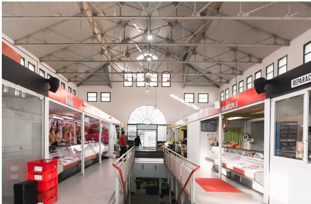
ABOVE Cruz de ocho puntas de la iglesia de San Xoán BELOW Plaza de Abastos de la Rúa Progreso

what had happened to the woman who had helped him.