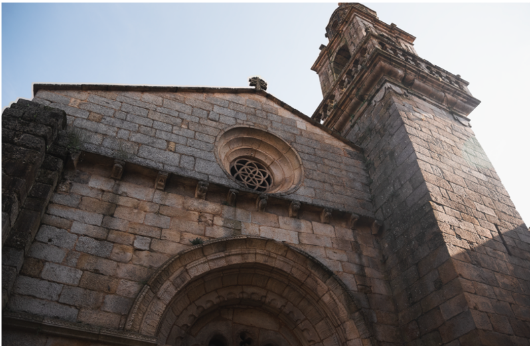
ABOVE Iglesia de Santiago BELOW Iglesia de Santiago FACING, ABOVE Las Nisas FACING, BELOW Plaza Buxán

dova. The families who took part in the trials were exempt from taxes, although it seems that Ribadavia never had an Inquisition Tribunal as the cases were heard in Santiago de Compostela.