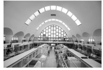
B Mercado de San Agustín