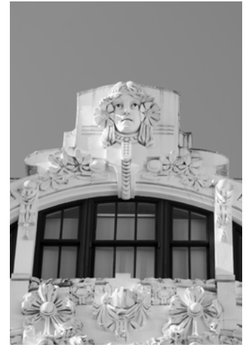
E Praza de Lugo — market