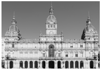
A Praza de María Pita and A Coruña City Council building