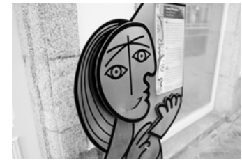
D Casa Museo Picasso