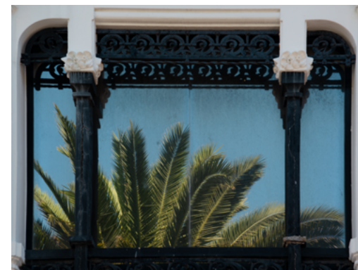
BELOW Kiosco Alfonso FACING Praza de Lugo market