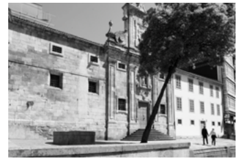
C Iglesia de Las Capuchinas and Museo de Belas Artes