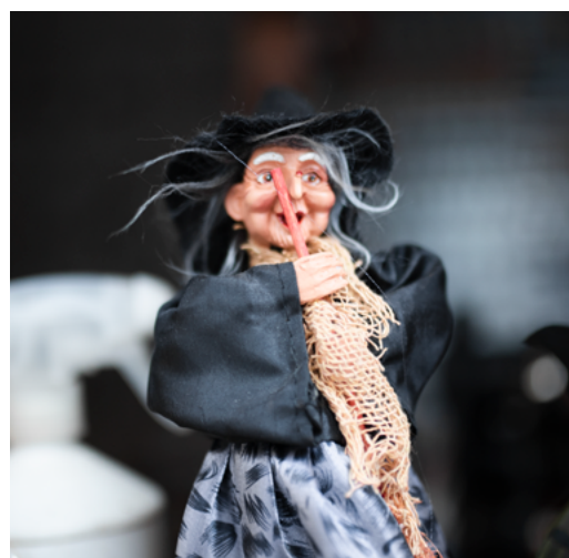
ABOVE Cruceiro da Rúa BELOW Meiga

On our walk we can spot some signs telling us that we are on the Spiritual Variant of the Portuguese Way, which connects the