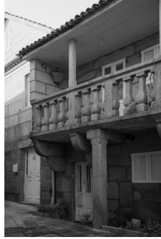
E Seafaring houses (rúa do Mar)