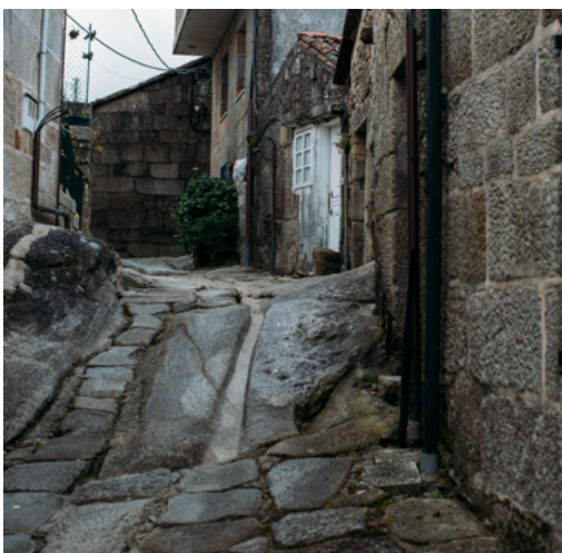
ABOVE Tinta Negra, old fishermen's net warehouse BELOW Grooves produced by cars loaded with algae

Nearby is the Marina Combarro , the first Spanish marina to win the Jack Nichol Marine Design Excellence Award in 2012, which holds the highest 5 Gold Anchors award, certified by the British Yacht Association. The facilities also include a small shopping and leisure centre with underground parking. It is the perfect place to sip on an aperitif, coffee, or drink whilst enjoying the sea views at Café-Bar A Tres Nudos , buy sailing clothes at Ronáutica , and to explore the estuaries and get into water-based activities, there is nowhere better than The Lost Tourist , where