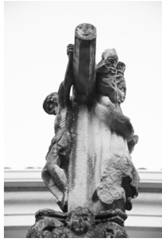
D Cruceiro da Rúa