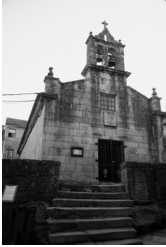
B Igrexa de San Roque