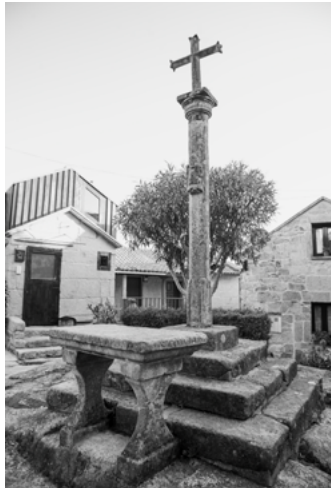
A Cruceiro de la praza de San Roque